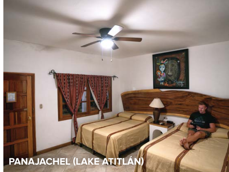
PANAJACHEL (LAKE ATITLÁN)