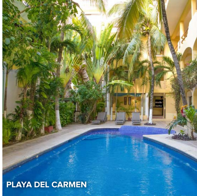
PLAYA DEL CARMEN