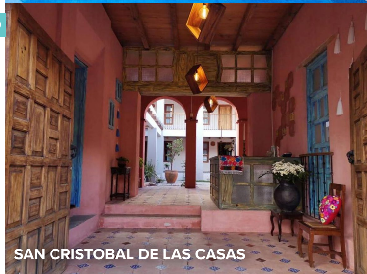
SAN CRISTOBAL DE LAS CASAS