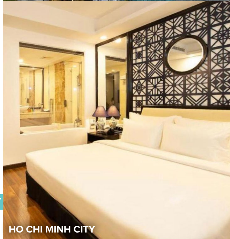
HO CHI MINH CITY