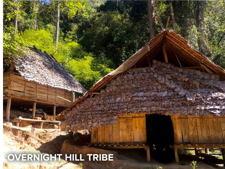
OVERNIGHT HILL TRIBE