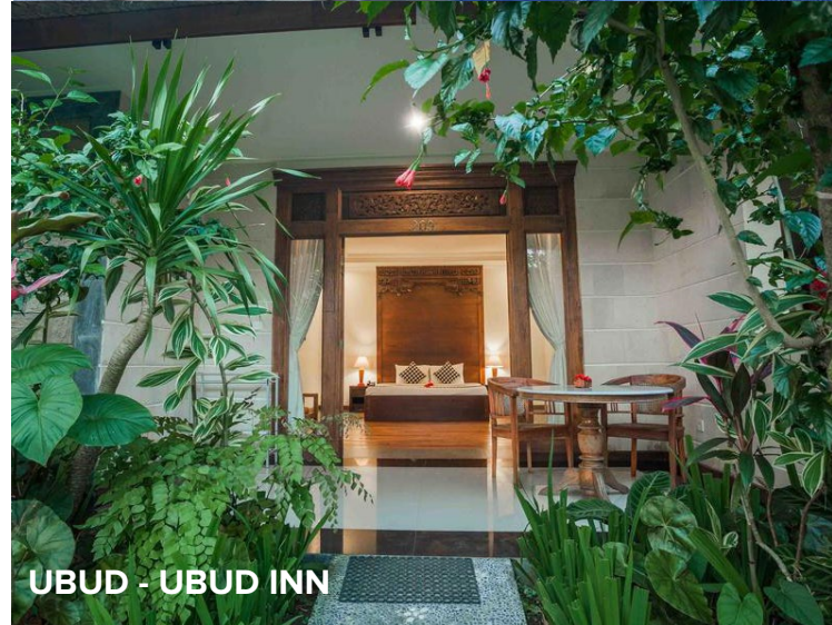
UBUD - UBUD INN

Twin/Double Rooms Ensuite WiFi & Air Con & Laundry Swimming Pool, Bar & Spa