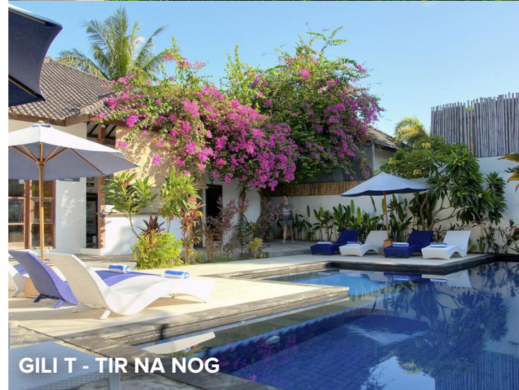
GILI T - TIR NA NOG

Twin/Double/Triple Rooms Ensuite WiFi, Air Con & Laundry Right on the beach!