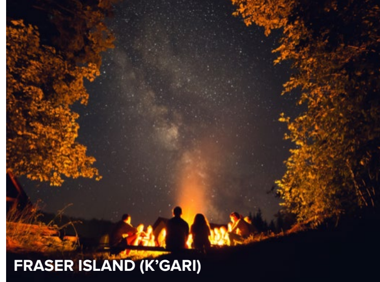
FRASER ISLAND (K'GARI)